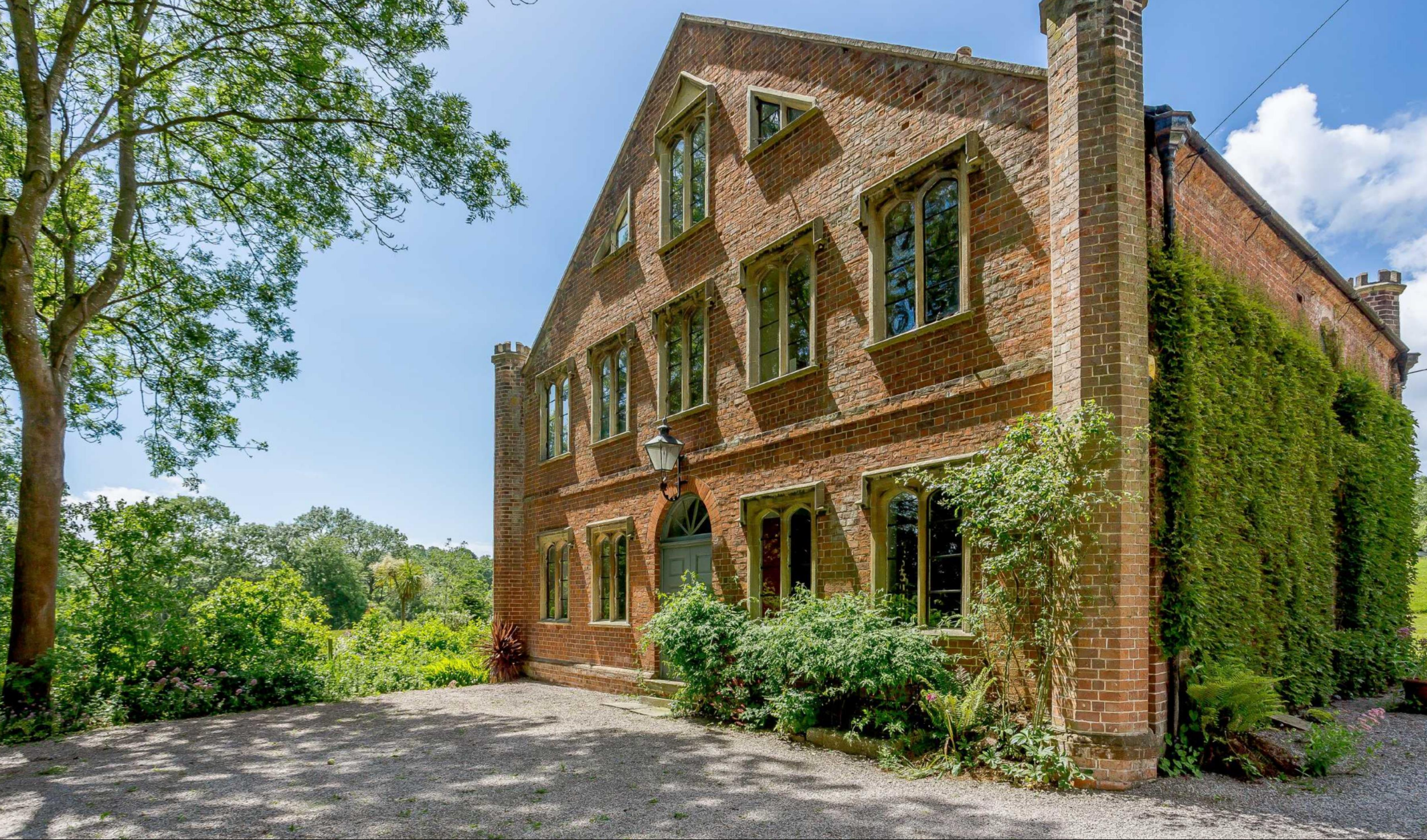
Bullo House Bullo Pill | Newnham | Gloucestershire | GL14 1EA